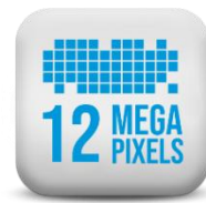
12MP Recording Capability