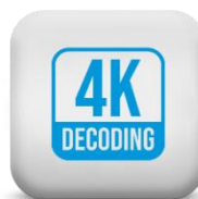
4K Decoding Technique