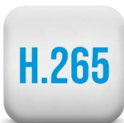
H.265 Compression Technique